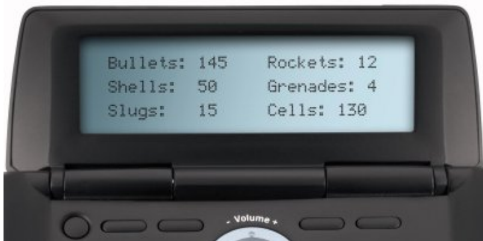
Image shown is a rendering of the display portion of the G15 G-series keyboard with the four soft buttons below it.